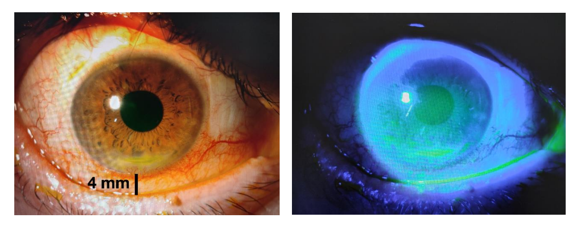
Figure 2: Slit-lamp view of the right ocular surface. Inferior scleral show of 4 mm. Figure 3: Fluorescein highlight in the inferior corneal epithelial defect.

During follow-up at the Cornea Unit, corneal scrapings were collected for smears and culture, and both were negative.