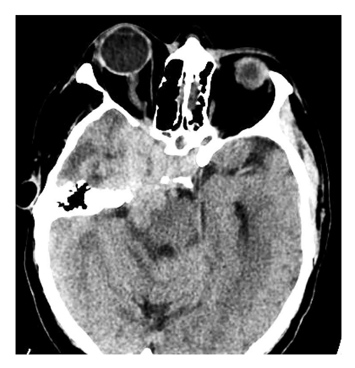
Figure 1: Cranial CT scan in axial view. The right ocular proptosis is evident, as well as the posterior tumour extension.

A 46-year-old male with a history of stage IV nasopharyngeal carcinoma with facial and orbital invasion who was referred to the Ophthalmology department due to proptosis. Diagnostic imaging tests (Fig. 1) showed tumour extension to the right cavernous sinus, temporal fossa, orbital and petrous apex, surrounding the internal carotid artery.