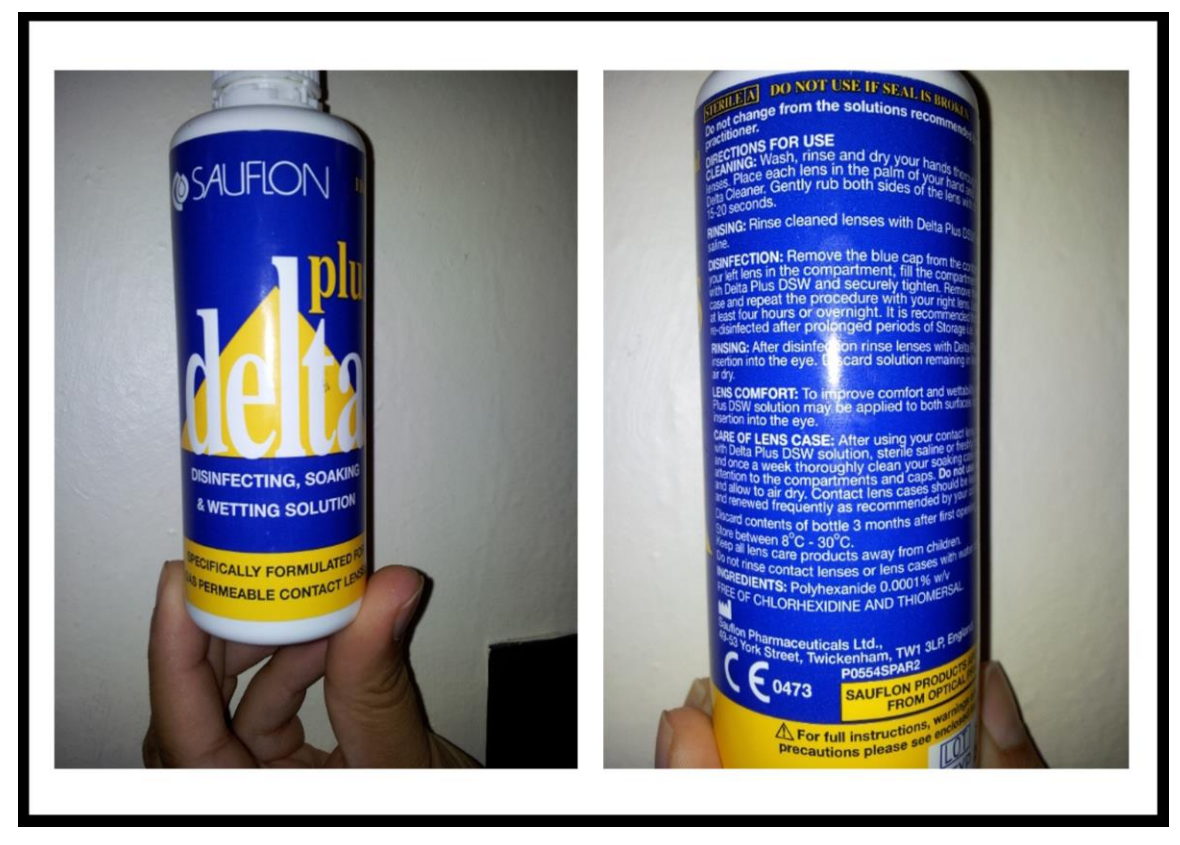
Figure 2: Contaminated contact lens disinfecting solution used by the patient

Confocal microscopy confirmed multiple inflammatory cells and a few possible cystic lesions in both eyes. The above contact lens history and confocal microscopy findings suggested a high probability of Acanthamoeba keratitis. Active treatment against Acanthamoeba when instituted resulted in exacerbation of her keratitis.